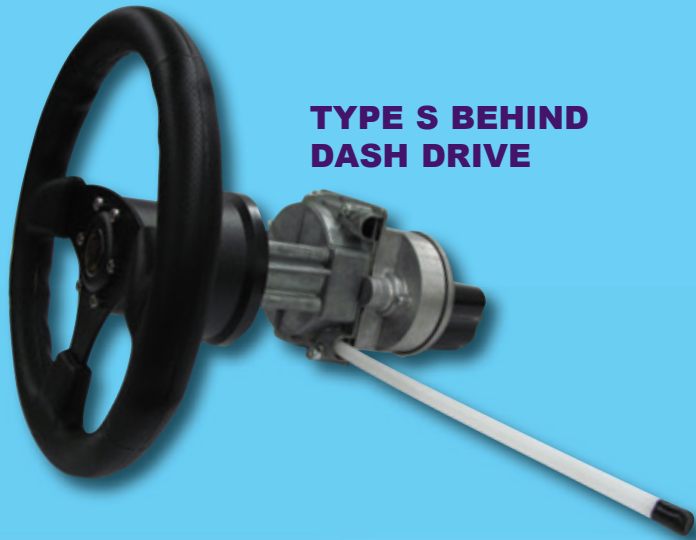
TYPE S BEHIND DASH DRIVE