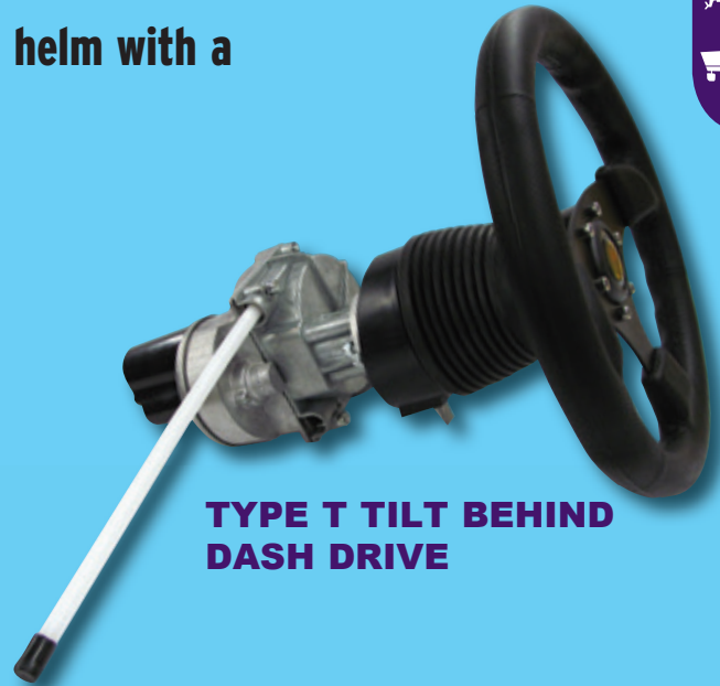
TYPE T TILT BEHIND DASH DRIVE